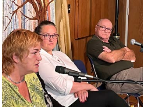
The Story Shepherds of Northern Ireland